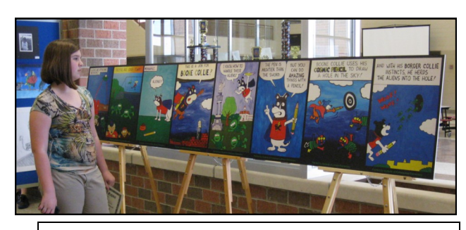
Image of the mural created by Cartoonist Bruce Quast for the 2012 5<sup>th</sup> Grade Arts Festival on display during the 2013 Student Art Show