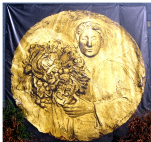
2013 Digital print on fabric by John Berry, east side of Belvidere City Hall, 401 Whitney Blvd.