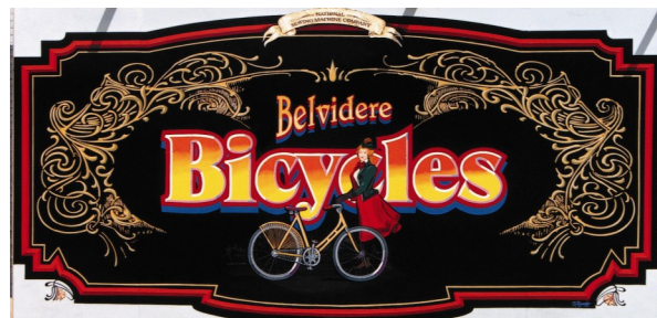
Metal panel: The “Lady Diamond” Bicycle by Steve Estes, Wall Dogs, 129 N. State St. 1997.