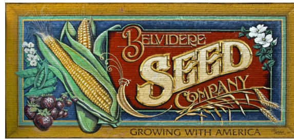
On brick: The Belvidere Seed Co by Noel Weber, Wall Dogs, at Buchanan & State Streets. 1997.