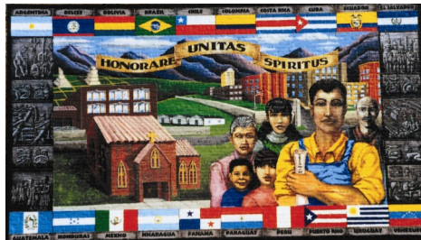
On brick: by Frank Matas & The Sun-Kissed Crew, west side of Apollo Theater, 104 N. State St . 1998

This is only a sample of the many murals.