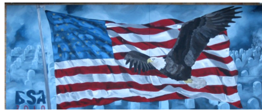
Wood panel: Eagle Scout Mural by Lindsey Morris, VFW Post, 1310 West Lincoln Ave. 2010.