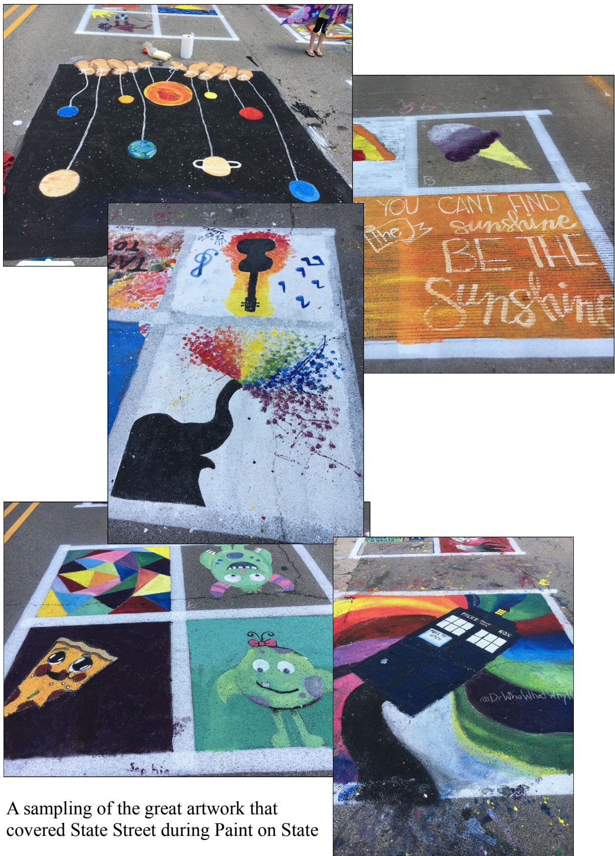
A sampling of the great artwork that covered State Street during Paint on State